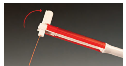
Flip the filament head into the open position. Filament should be 90° to the handle.